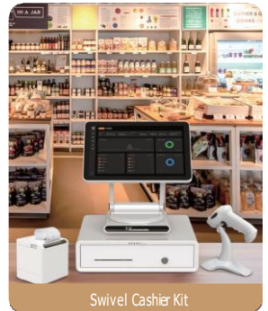
Swivel Cashier Kit