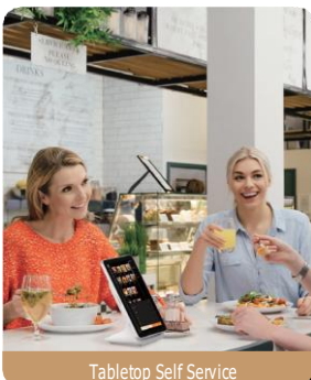
Tabletop Self Service