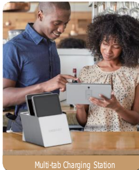
Multi-tab Charging Station